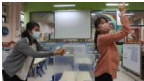
3. Child catches the towel