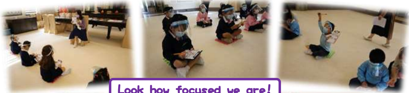
Look how focused we are!