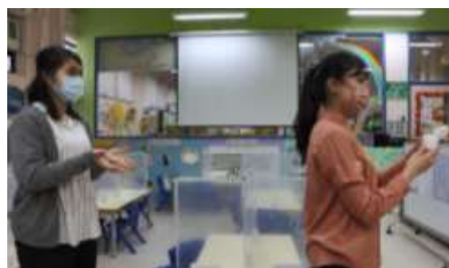
2. Parent stands in front of child and toss the towel